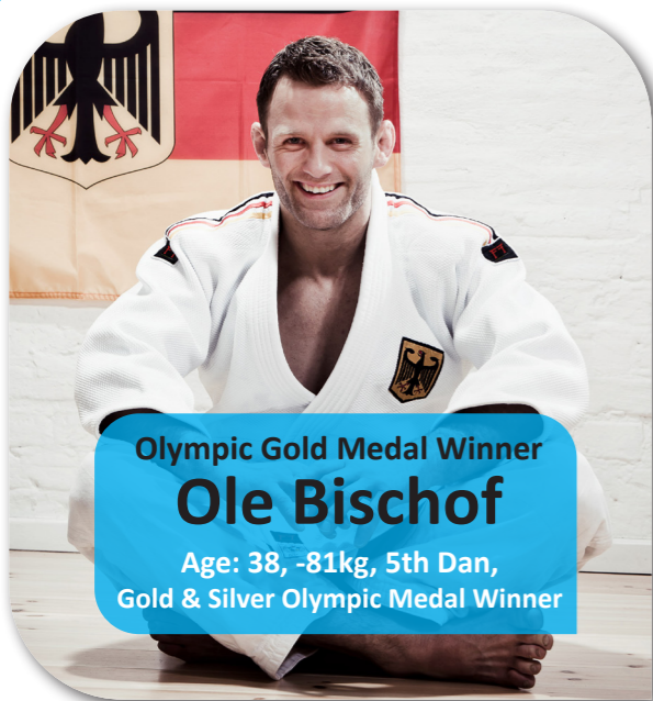
Olympic Gold Medal Winner Ole Bischof Age: 38, -81kg, 5th Dan, Gold & Silver Olympic Medal Winner

This training course, organised together with the German Federal Judo Association (DJB), is aimed at Judo IPPON Girls and POWER Boys aged 8 through 17 years from the 7th kyu.