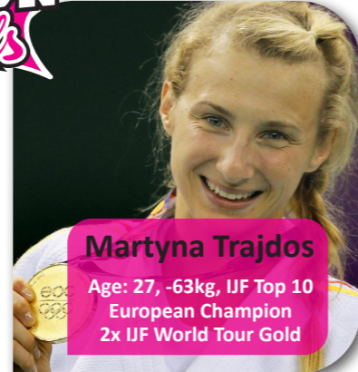
Martyna Trajdos Age: 27, -63kg, IJF Top 10 European Champion 2x IJF World Tour Gold